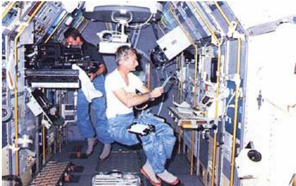
Fig. 4. At the background, Byron Lichtenberg during FPM operations aboard Spacelab-1; at the rear; Owen Garriot.