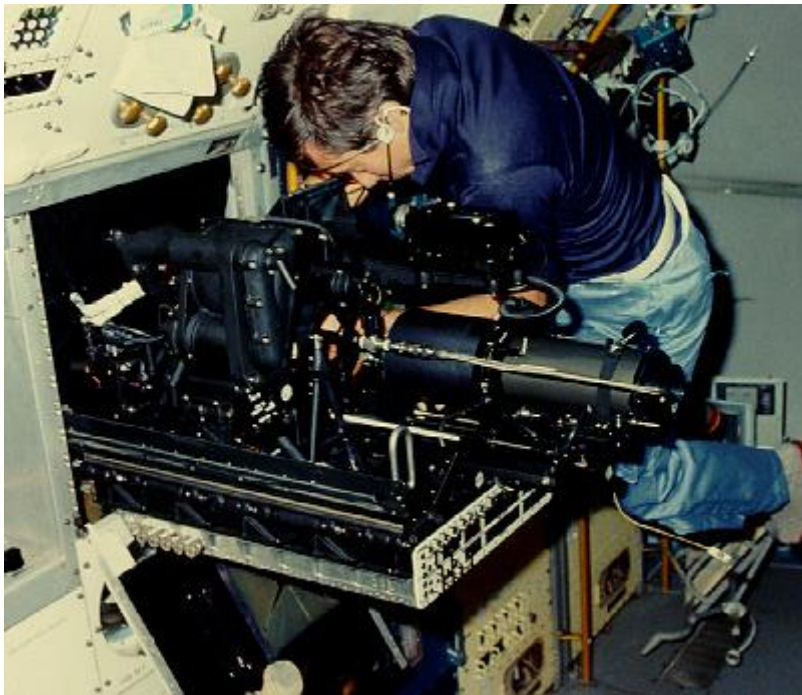
Fig. 3. Ulf Merbold during FPM operations aboard Spacelab-1 (1983).